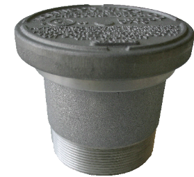
4” vent (245M)