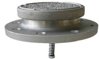
4” vent (245F)