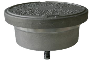
6” vent (245)