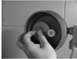
FIGURE 4: Raising the float with thumb nut to desired alarm trip point.