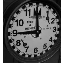
FIGURE 5: Hold thumb nut at desired trip point. Example- Alarm set point at 9 feet - 0 inches.