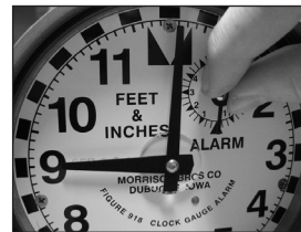
Figure 6: Setting Alarm pointer. Example - Alarm will now sound when level reaches 9 feet - 0 inches.