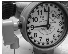
Figure 5: Hold thumb nut at desired trip point. Example - Alarm set point at 9 feet-0 inches.