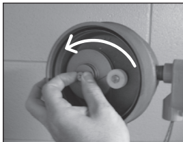
Figure 4: Raising the float with thumb nut to desired alarm trip point.