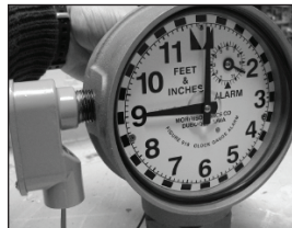
Figure 5: Hold thumb nut at desired trip point. Example - Alarm set point at 9 feet-0 inches.