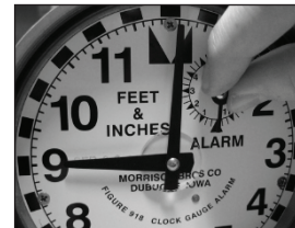
Figure 6: Setting Alarm pointer. Example - Alarm will now sound when level reaches 9 feet - 0 inches.