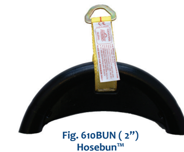
Fig. 610BUN (2") Hosebun™