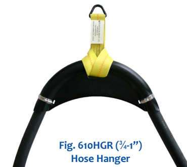
Fig. 610HGR (3/4-1") Hose Hanger