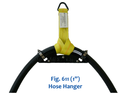
Fig. 611 (1") Hose Hanger

The 610 hose hanger and Hosebun™ protects the bending radius, protecting the hose from kinking. This product is easy to install and has a 5-1 safety factor.