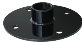
Fig. 610 Standard Base 610B--0100 WAPB

The 610 Standard Base simplifies the anchoring process of a 610 hose retriever by eliminating the need to break concrete. The 610 Hinged Base allows the hose retriever to be tilted 90° to grade level for installation and service.