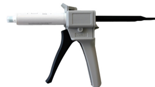
434CBB0001 1B 434CBBA001 1A

Specific item numbers and model details on next page.