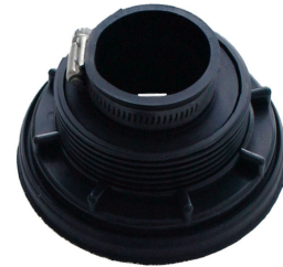
434CB-0075 1B (3/4") through 434CB-02001B (2")