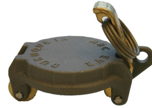
305C (2'') standard handle