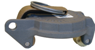
305C (2'') low profile handle